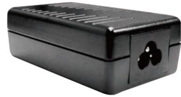
FIG 3: IEC-320-C6