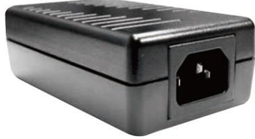
FIG 1: IEC-320-C14