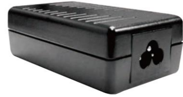
FIG 3: IEC-320-C6