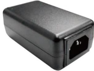
FIG 1: IEC-320-C14