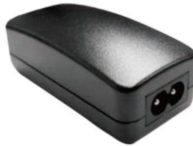
FIG 2: IEC-320-C8