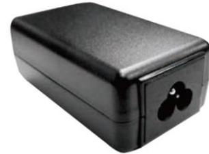
FIG 3: IEC-320-C6