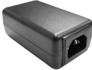
FIG 1: IEC-320-C14