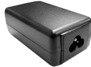
FIG 3: IEC-320-C6