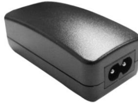
FIG 2: IEC-320-C8