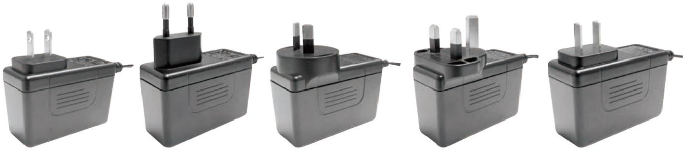
FIG 1: American