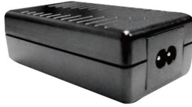
FIG 2: IEC-320-C8