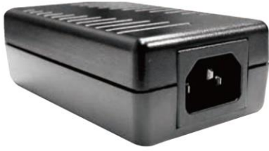
FIG 1: IEC-320-C14