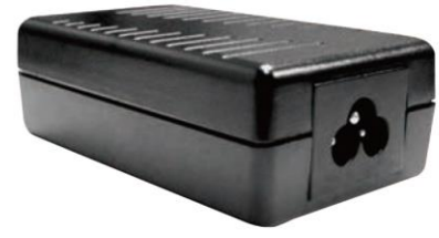
FIG 3: IEC-320-C6