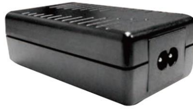
FIG 2: IEC-320-C8