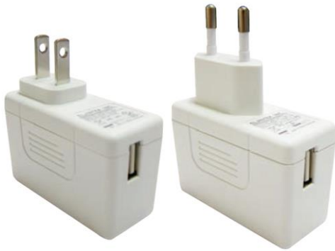
FIG 1: American