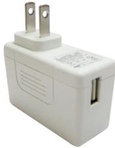
FIG 1: American