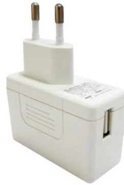
FIG 2: European